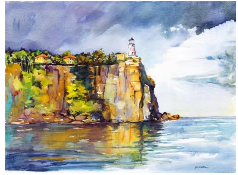
Galena Center for the Arts 219 Summit Street, Galena Illinois