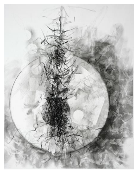
Galena Center for the Arts 219 Summit Street, Galena Illinois