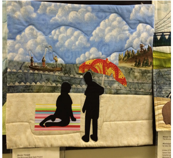
Messipi Threads River Quilts

Messipi Threads River Quilts on display through Nov. 22