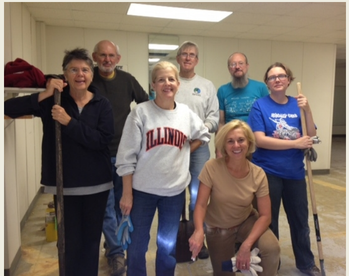
Last year's crew cleared 4000 lbs of floor tiles in one day!

Please RSVP to Carole at 815-777-0410 or email to info@GalenaCenterForTheArts.com