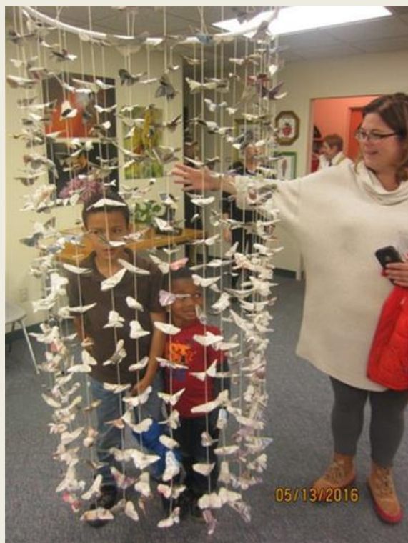
Butterfly mobile created by the 4th grade students