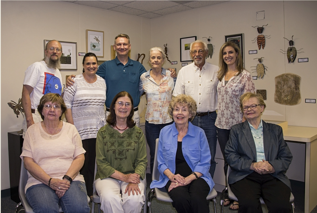
Center for the Arts Board of Directors