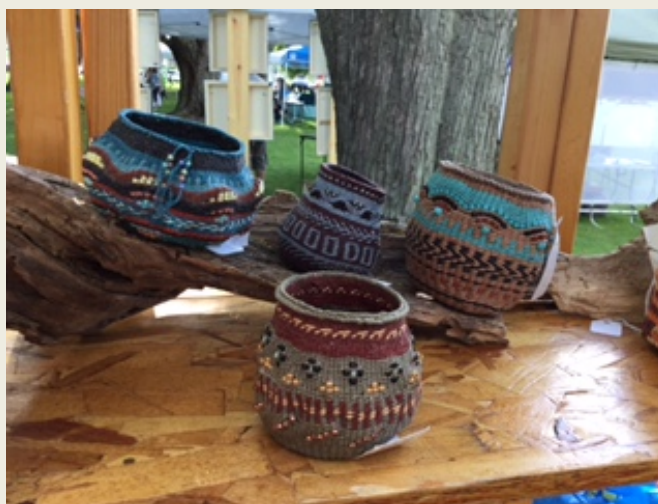
Toni Klingler's Art