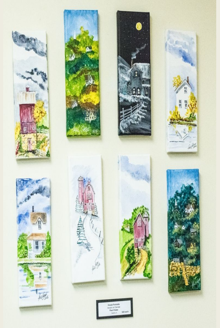
Small Houses by Paul Chase