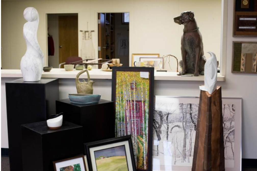
New artwork arriving for the Regional Artists Gallery