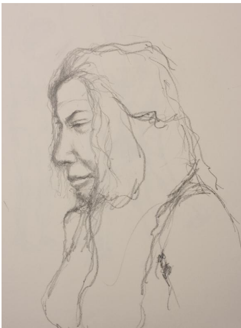
Sketch by Sheila Haman