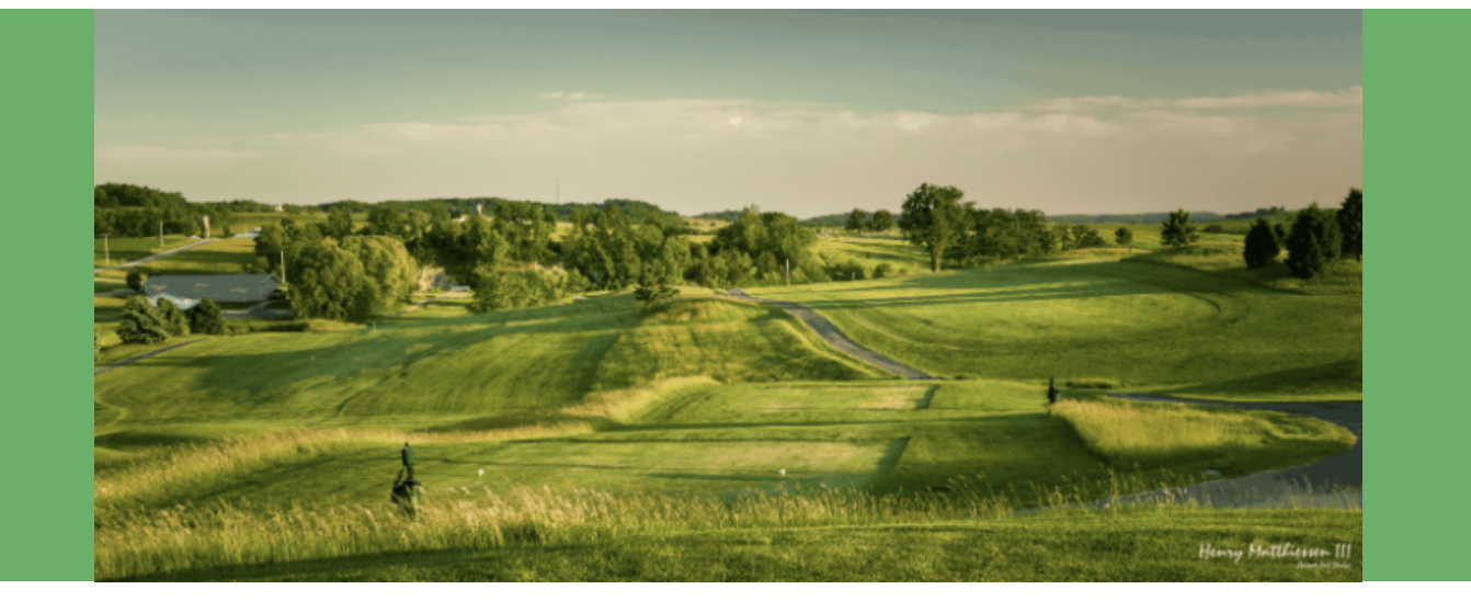
The Back Nine at Woodbine Bend Golf Course