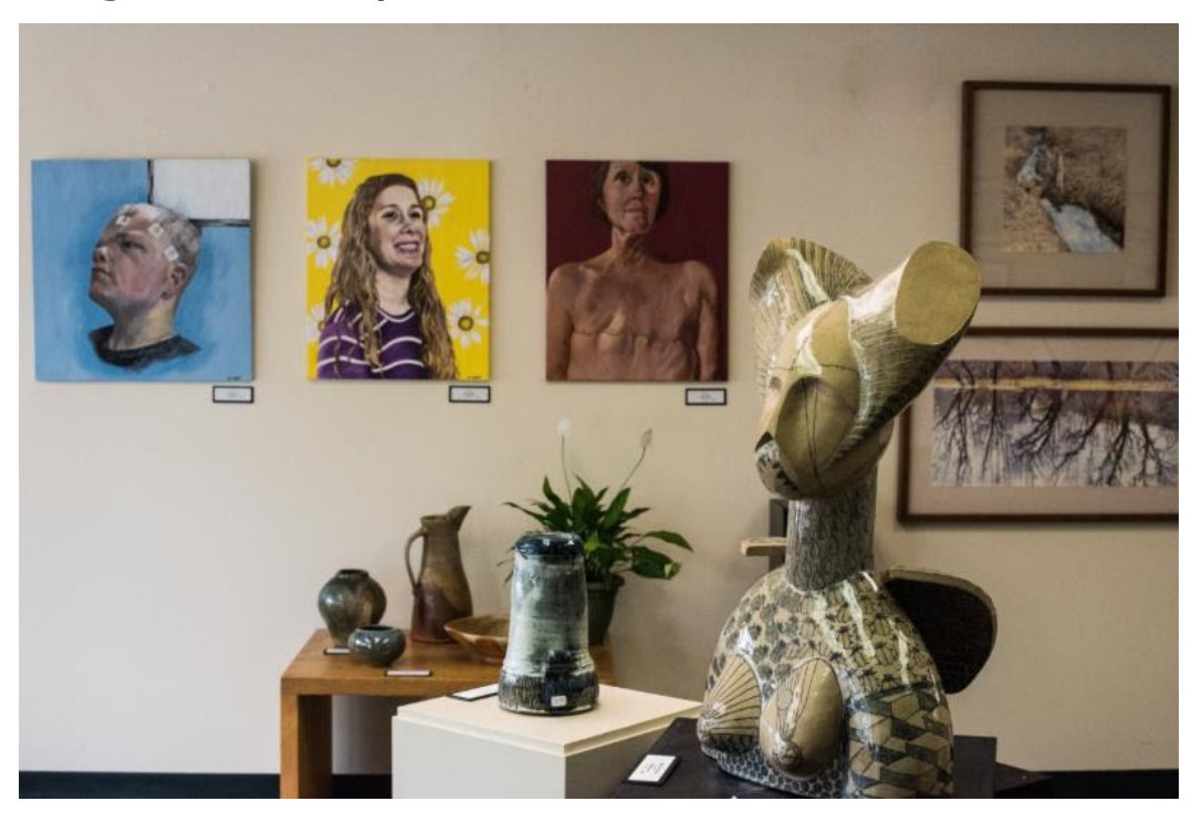
Regional Artists Gallery

Artists from around the Tri-State area display their work in our gallery. We have some new young artists bringing in work and our beloved artists always surprise us with new work each time we change the display. The gallery will be changing out to a new exhibit soon, so check out what is here now, if you had not had a chance to visit us recently, and again at our reception on the 10th.