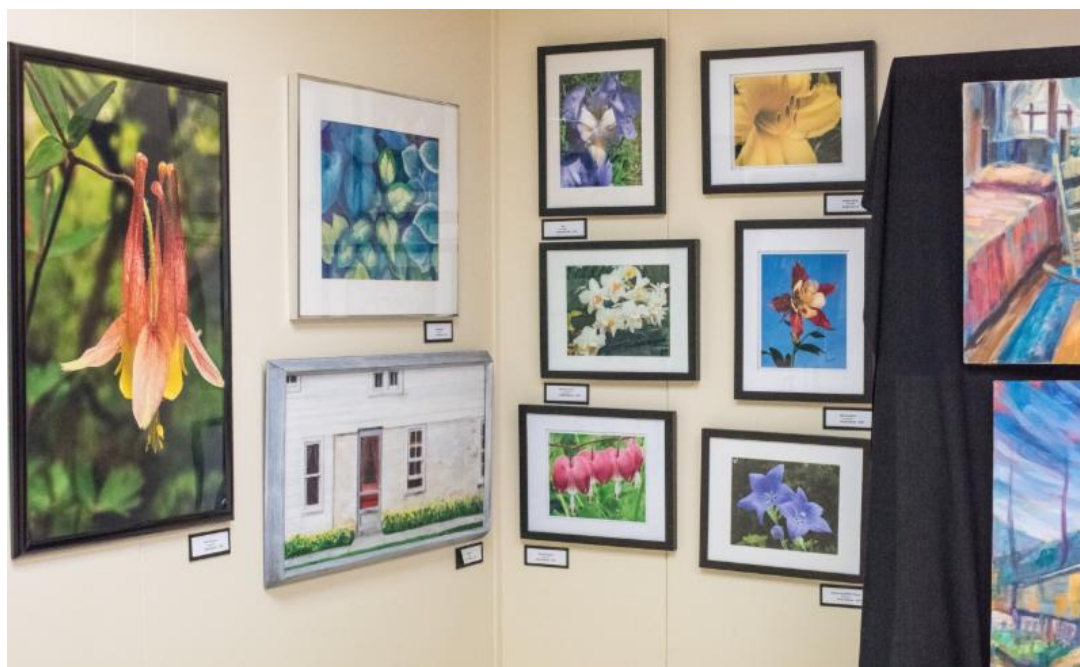
Feature Gallery - Paintings and photography by Sally and Dwight Bischel

The Feature Gallery celebrates Dwight and Sally Bischel's life in art with watercolors, acrylics, and photographs.