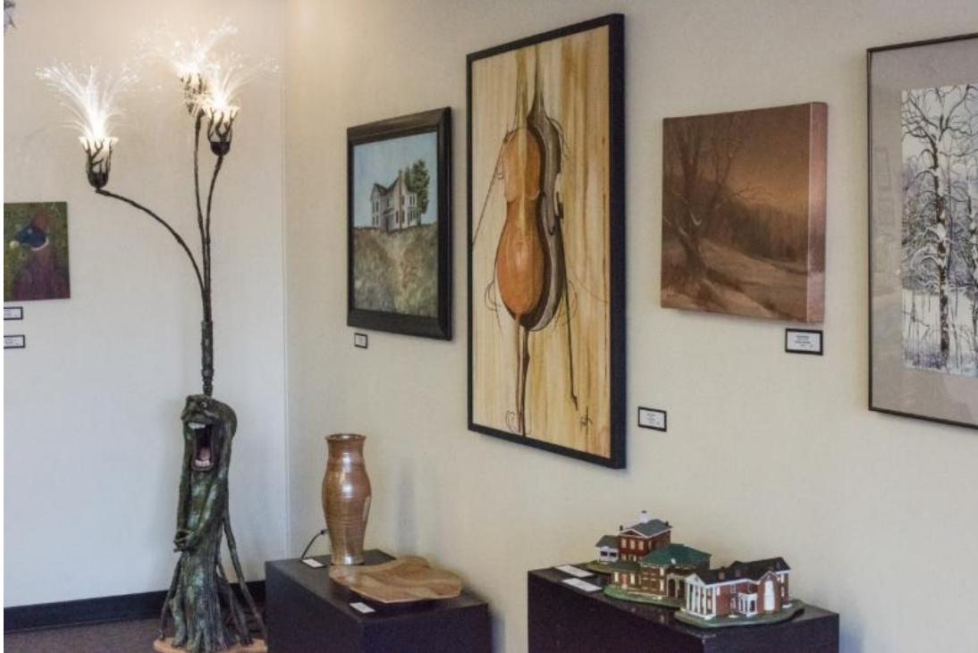
Regional Artists Gallery