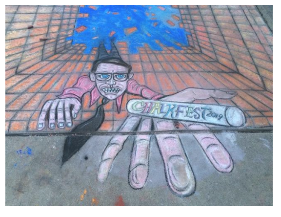
A little help, pleeze!