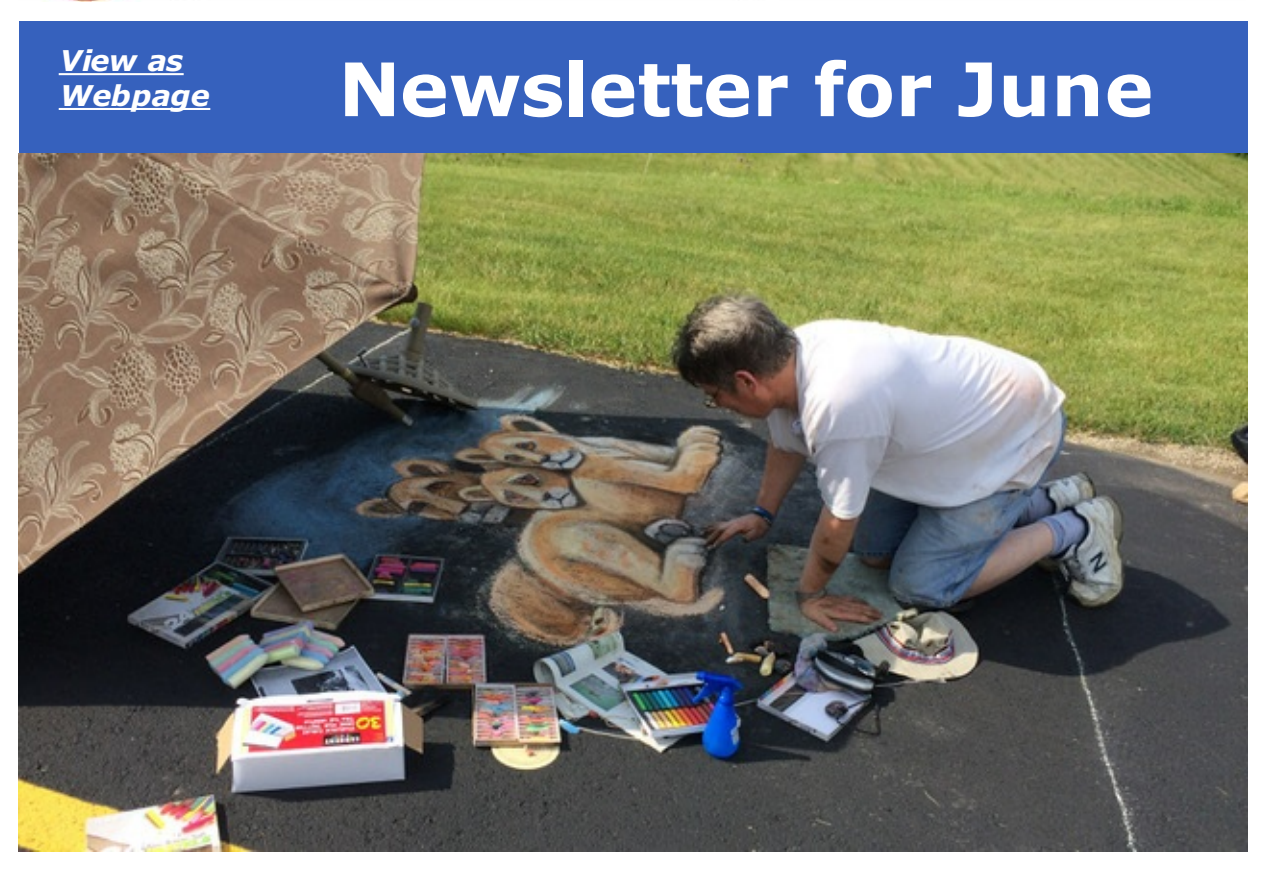
Click here to contact us by e-mail