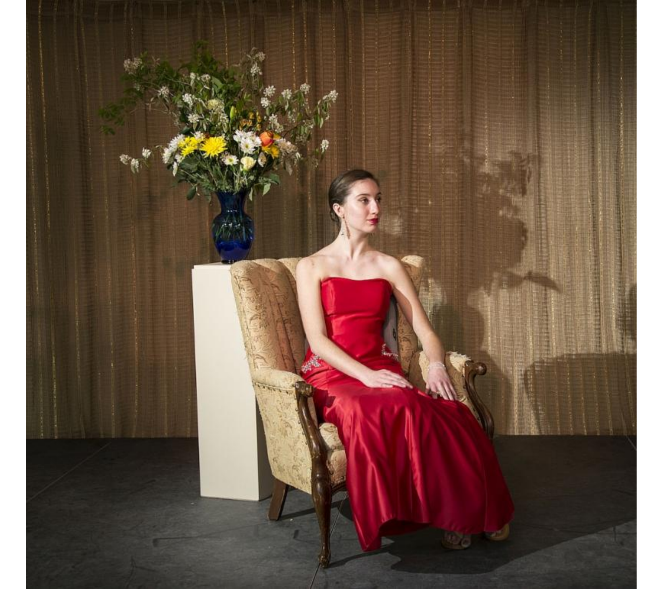
Model for the Portrait Workshop