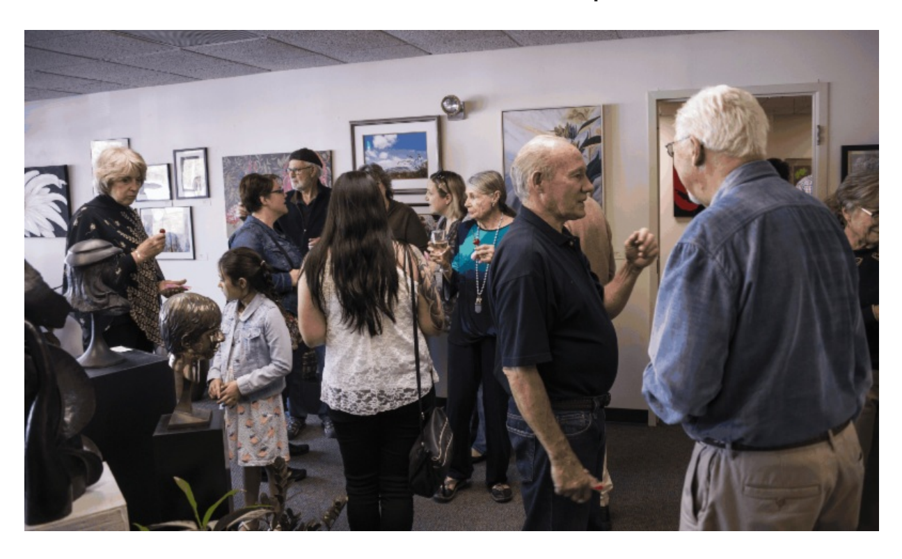
Art in Bloom Opening Reception