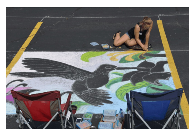
Chalker at work

Don't want to get down on your knees to chalk? You or your business can sponsor a chalk artist's space for the event! For more information, call (779) 214-0261.