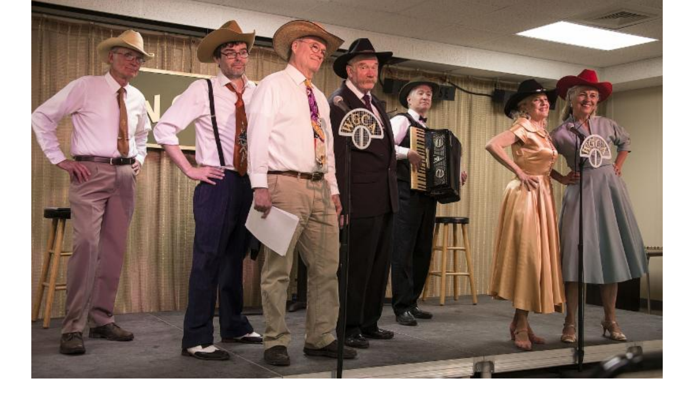
Scene from the Spring Radio Show