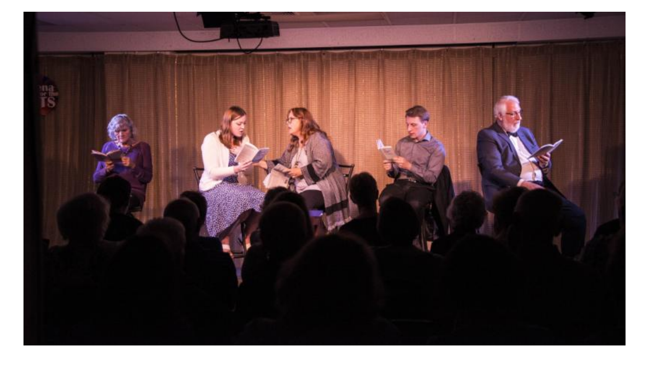
The Cocktail Hour Table Reading